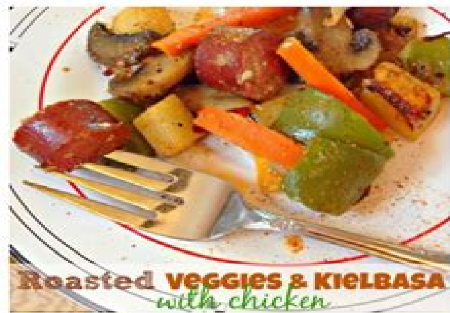
Roasted VEGGIES & KIELBASA with chicken