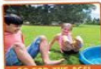
GO FOR THE ACE!