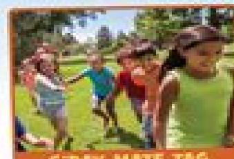
G'DAY MATE TAG