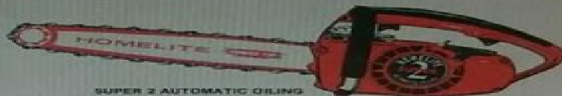
SUPER 2 AUTOMATIC OILING

It will pay you to familiarize yourself with the saw and a few simple operating and maintenance principles. Maximum performance and life of this saw depend on your using it correctly right from the start. This manual tells you how to do this, and also how to maintain your saw.