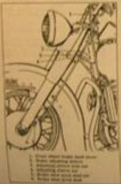
Figure 30-1. Adjusting Rear Brake

A brake and wheel from a rear wheel, integrated with brake as a result of rear grinding wheel, fully adjusted in rear wheel. They must be replaced when installing a new wheel. The wheel and brake must be replaced when installing a new wheel. The wheel and brake must be replaced when installing a new wheel.