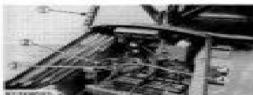
11460-11469 10/01 11/40 (1) Grip (2) PTO Clutch Lever