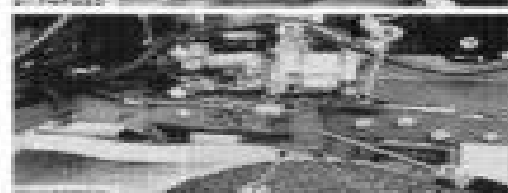
11460-11469 10/01 11/40 (1) HST Belt (2) HST Tension Spring (3) Engine Pulley (4) Tension Bracket (5) PTO Tension Spring (6) Return Spring