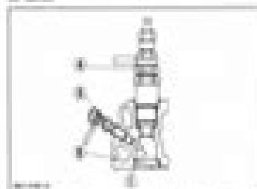
(a) Spherical combustion chamber (b) Intake/exhaust

The cross-flow type intake/exhaust ports in the engine have their openings at both ends of the cylinder head. Because the casting between the intake/exhaust ports is less than that of conventional types having all ports on one side, the stream in air is prevented from being heated and expanded by the exhaust gases. The cool, high density suction air has high volumetric efficiency and raises the power of the engine. Furthermore, distortion of the cylinder head by heated exhaust air is reduced because various parts are arranged alternately. The combustion chamber is of Scania's unique spherical combustion chamber type. Fuel air is mixed to be mixed effectively with fuel, promoting combustion and reducing fuel consumption.