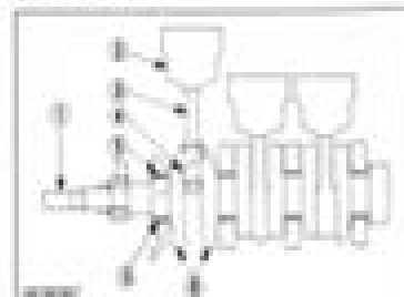
(a) Crankshaft (b) Main bearing (c) Crankshaft bearing (d) Side bearing (e) Crankshaft bearing (f) Side bearing (g) Crankshaft bearing (h) Side bearing

The crankshaft (1) is driven by the piston (2) and connecting rods (3) and carries reciprocating motion into rotary motion. It also drives the oil pump, camshaft and fuel camshaft. The counterweights (4) are integrated into the unit to minimize bearing wear and lubricating oil temperature rise.