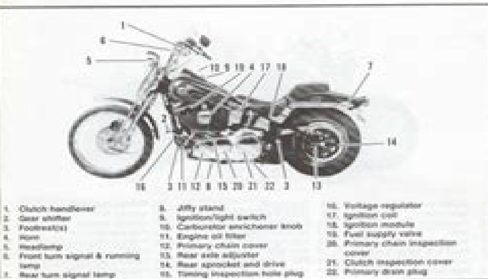
FIGURE 1-5. 1991 FXSTC - Left Side View