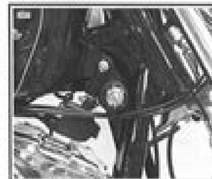
Figure 2-81. Center Cable Routing