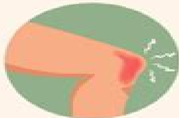
Giving herself intentional bruises