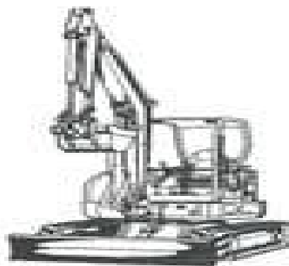
FIGURE 1 (LHD)