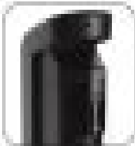
Figure 2: Back View of the Heater

Read and Save These Instructions Read and save these instructions for future reference. They contain important safety information and instructions for use.