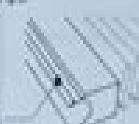
LOCK EDGE SIDE OF SIDE CURTAIN