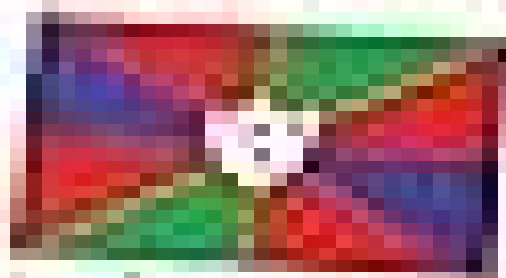
Flag of the Republic of the Philippines