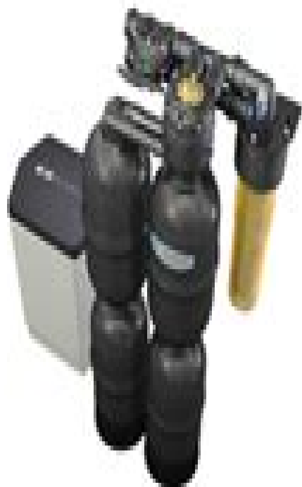
Kinetico Premier Series®