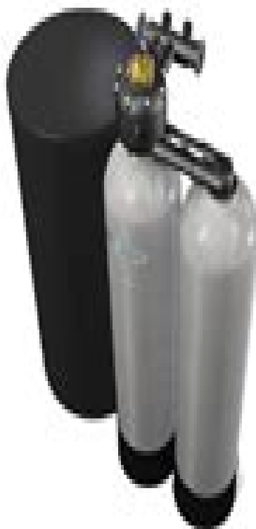
Kinetico Signature Series®