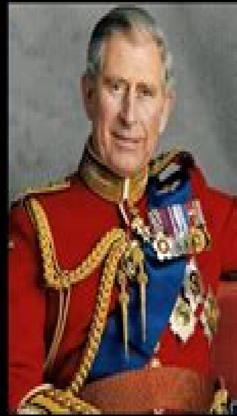
King Henry VIII Queen Victoria Queen Elizabeth King Charles III