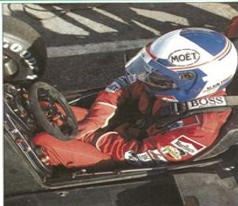
Alain Prost, winner of the last three Grands Prix, waits patiently in his McLaren-TAG.

Preview with John Watson, plus regular updates on qualifying times, lap by lap coverage and full race results. Check your newspaper for up-to-date details.