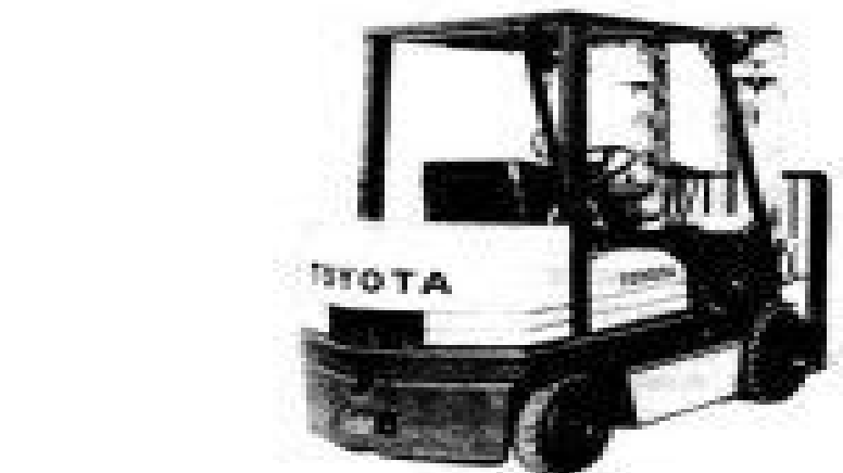
Vehicle Rear View