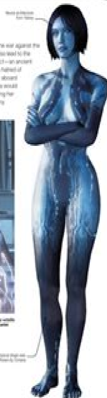
Cortana's armor is made of Kevlar.