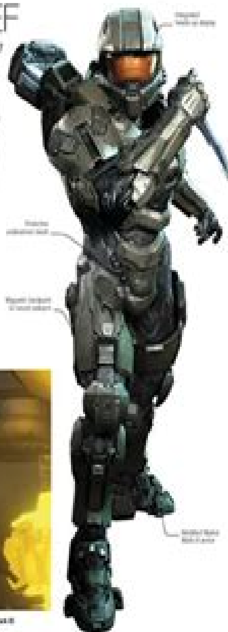
Master Chief's armor is made of Kevlar.