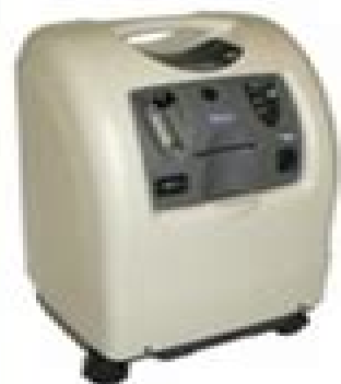
Perfecto 2 Concentrator