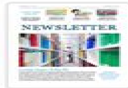
Rundbrief – Elegant