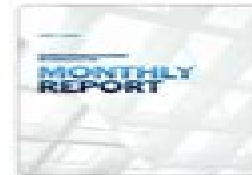
Bericht – Beruflich