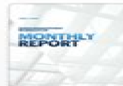
Bericht – Beruflich