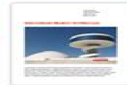
Bericht – Modern