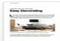
Bericht – Zeitgemäß