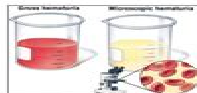
Figure 1. Hematuria