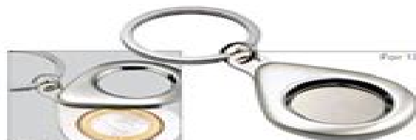
For 1 EURO COIN