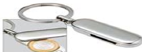
For 1 EURO COIN