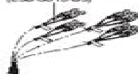
Remote controller * (A70-2083-15)