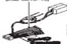
DC cord * (E30-6615-15)