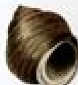
Common Periwinkle (B,V)

Euryspira angulatum To 1 in. (2.5 cm) high Shell has 8-10 deep, blade-like ribs.