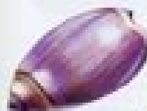
Purple Dwarf Olive (W)

Littorina littorea To 1 in. (2.5 cm) Gray to brown rounded shell has a low spine and low spiral ridges. More typical is white. Found in estuarine waters.