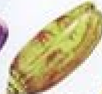
Lettered Olive (CB, CB)

Olivella biplicata To 1.5 in. (4 cm) high Smooth shell has a central spine. Color varies from purple to white and brown. Carnivorous scavenger feeds on animal remains. Shells were used by Native Americans in jewelry.