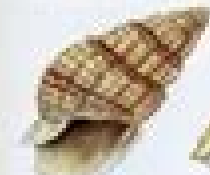
Three-lined Nassa (E)

Macroschisma carolinense To 2 in. (5 cm) Large, brown shiny and shell is white-spotted. Note prominent teeth lining central opening.