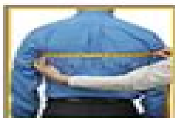
(7) Back Chest Length