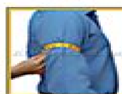
(14) Bicep /Arms