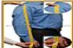
(2) Full Selves