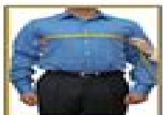
(6) Front chest