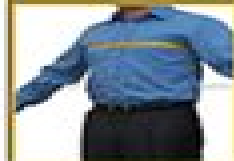
(3) Full Chest