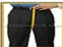
(12) Full Crotch