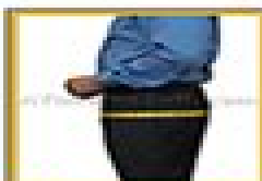
(10) low Hips for Pants