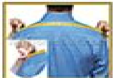
(1) Full Shoulder