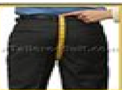
(13) Pant Length