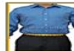
(9) Pants Waist