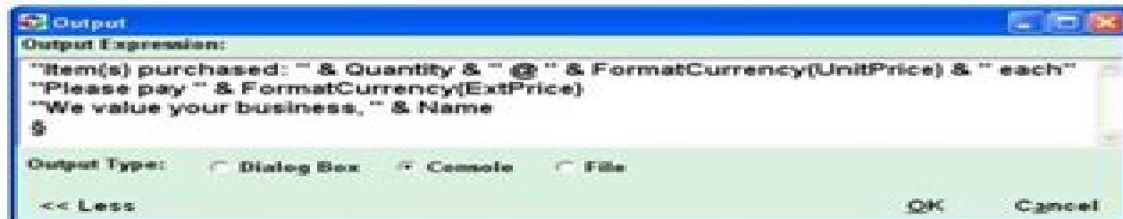
Adding FormatCurrency function (in two locations)

Visual Logic has a number of built-in functions. The FormatCurrency function can produce better output for the UnitPrice and ExtPrice in our sample program. To use FormatCurrency, identify the variable to be formatted inside the parentheses ( ) as shown next.