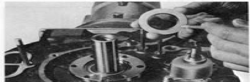
Fig. 1-78 Fitting thrust plate