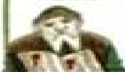
1769 James Watt's steam engine