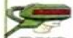
1869 Thomas Edison's light bulb