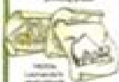
1769 James Watt's steam engine