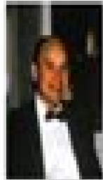
Eugene George Rochow