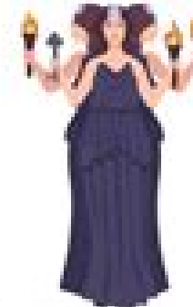
HECATE | TRIVIA