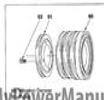
Figure 71: Crankshaft Damper and Pulley