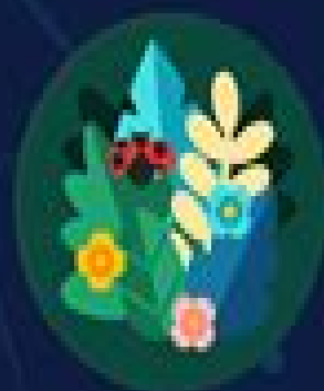
Science & nature