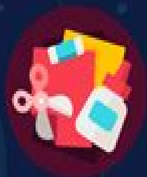
Arts & crafts