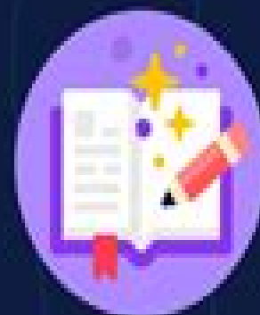
Stories & writing