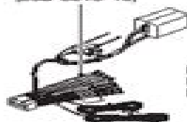
DC cord * (E30-6615-15)