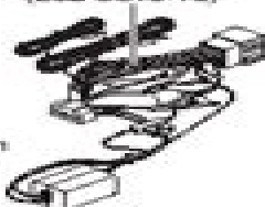
Cord with plug (E30-6615-05)