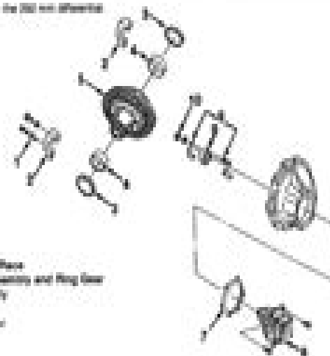
Figure 14. Differential Carrier Subassembly

The Adapter is based on the 292 mm differential.