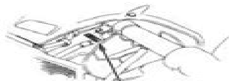
FRAME SERIAL NUMBER

The engine serial number is stamped on the rear right side of the engine case.