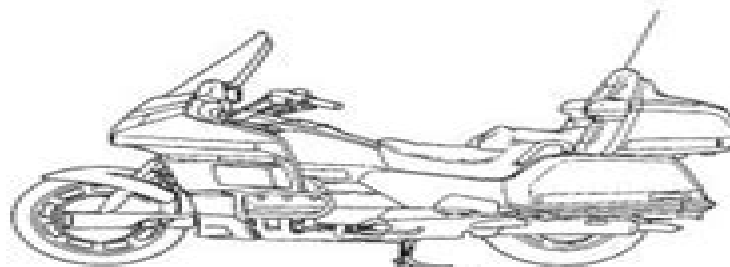
ENGINE SERIAL NUMBER

The engine serial number is stamped on the rear right side of the engine case.