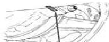
FINAL DRIVE SERIAL NUMBER

The Vehicle Identification Number (VIN) is located on the right side of the frame near the steering head on the Safety Certification Label.