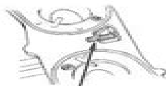
CARBURETOR IDENTIFICATION NUMBER

The frame serial number is stamped on the right side of the steering head.