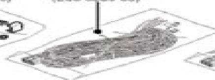
*Cord with connector (E30-6340-05)