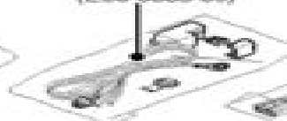
*Cord with connector (E30-6339-05)