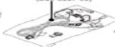
*DC cord (E30-6338-05)