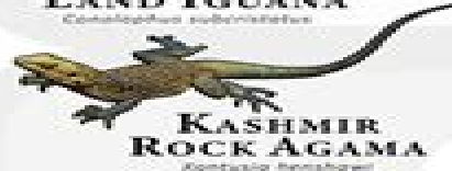
KASHMIR ROCK AGAMA Lacerta kashmiri