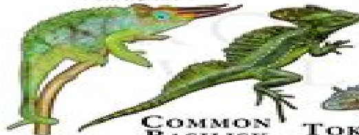
COMMON BASILISK Basiliscus basiliscus