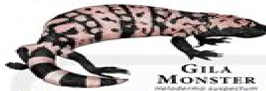
GILA MONSTER Heloderma suspectum