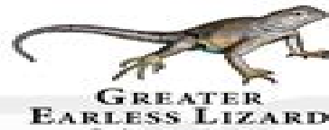
GREATER EARLESS LIZARD Crotaphytus wislizeni