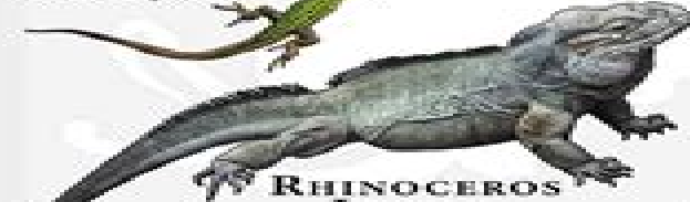
RHINOCEROS IGUANA Cyclura cornuta