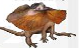
FRILL-NECKED LIZARD Chlamydosaurus kingii