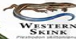
WESTERN SKINK Plestiodon skinkianus