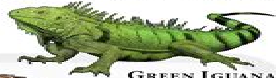
GREEN IGUANA Iguana iguana