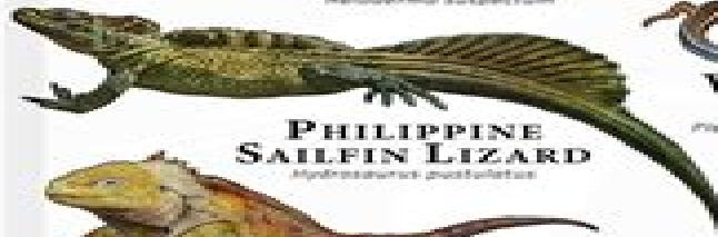
PHILIPPINE SAILFIN LIZARD Hydrosaurus pustulatus