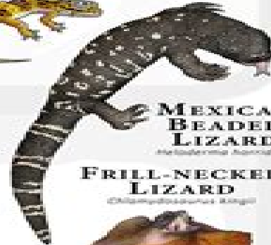
MEXICAN BEADED LIZARD Heloderma horridum