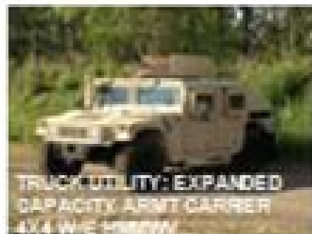
TRUCK UTILITY: EXPANDED CAPACITY ARMY CARRIER 4x4 W/IE HMMWV