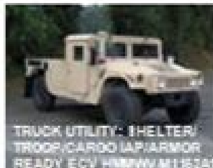
TRUCK UTILITY: SHELTER/ TROOP/CARGO IAPI/ARMOR READY ECV HMMWV M1152A1