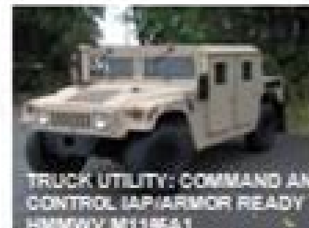
TRUCK UTILITY: COMMAND AND CONTROL IAPI/ARMOR READY HMMWV M1165A1

M1152A1 replaces M1037, M1097, M1113, and most M598, M1038