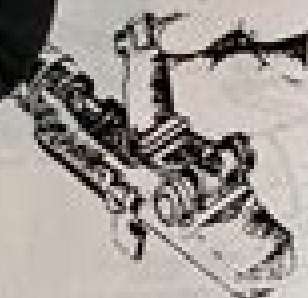
Figure 14. Removal and installation of bolt assembly