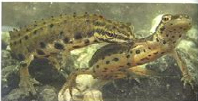
Male (left) and female of Smooth Newt, sp. Lissotriton , N. Greece

in winter in S of range but more typically around March in N of range. Males court females by fanning pheromones from their cloaca towards potential mates using their tail-tip. A spermatophore is released and absorbed by the female. Females deposit up to 300 eggs individually, often folding aquatic vegetation around each egg. Freshly metamorphosed juveniles may be encountered in summer. At high elevations or in cold shady waters, larvae may spend the winter in the water to complete metamorphosis the subsequent year. Feeds on various arthropods, snails and worms, but also on the larvae of other amphibians. Like other newts, may be seen feeding on frog spawn in spring.