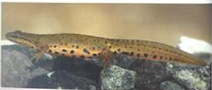
Female Smooth Newt, sp. greenii , N. Greece