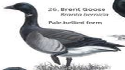
26. Brent Goose Branta bernicla Pale-bellied form