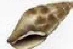
Carinate Downshell (W)

Chamaelea picturata To 4.5 in. (11 cm) Yellow-white to brownish shell has raised ribs but lacks long spines. Note brown spots on outer lip of shell.