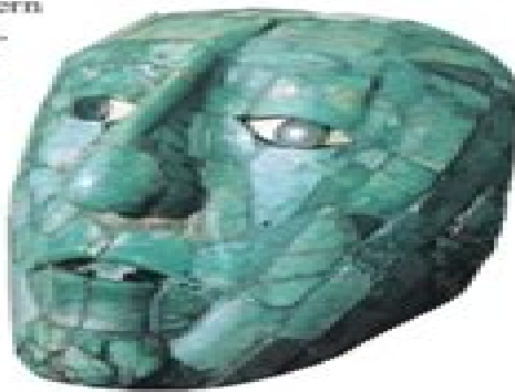
▼ Maya jade death mask, seventh century A.D.

Archaeologists have identified at least 50 major Maya sites, all with monumental architecture. For example, Temple IV pyramid at Tikal stretched 212 feet into the jungle sky. In addition to temples and pyramids, each