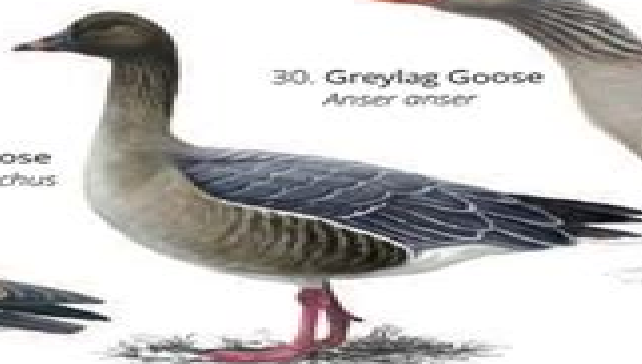
30. Greylag Goose Anser anser