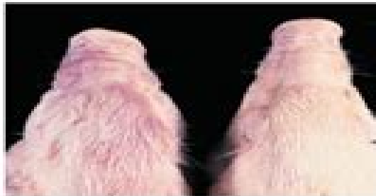
2.67 Growing piglets. Perineal vesicular lesions. Note discoloring and abnormality of the penis as a consequence of atrophic and chronic catarrhal inflammation.