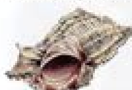
Carinate Downshell (W)

Chamaelea alveolata To 2 in. (5.1 cm) Elaborate pinkish-white to brownish shell with long teeth.