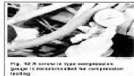
Fig. 12 A screw-in type compression gauge is recommended for compression testing.