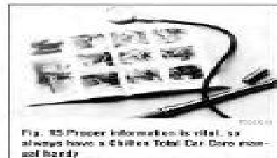
Fig. 15 Proper information is vital, so always have a Dillon Total Car Care manual handy.

The choice of a timing light should be made carefully. A light which works on the DC current supplied by the vehicle's battery is the best choice. It should have a sensor tube for brightness. On any vehicle with an electronic ignition system, a timing light with an inductive pickup that clamps around the No. 1 spark plug cable is preferred.