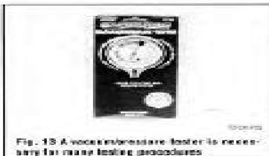
Fig. 13 A vacuum pressure tester is necessary for many testing procedures.