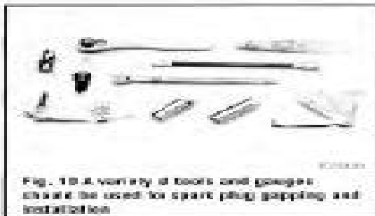
Fig. 10 A variety of tools and gauges should be used for spark plug gapping and installation.