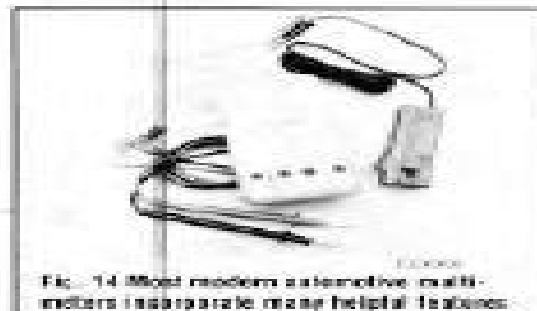
Fig. 14 Most modern automotive multi-meters incorporate many helpful features.