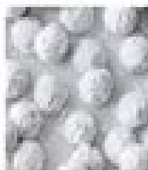
Homemade Wedding Cake Cookies ... Macadamia nuts and pineapple ...