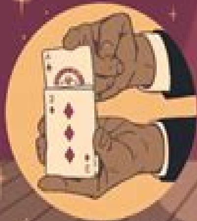
The Rising Card