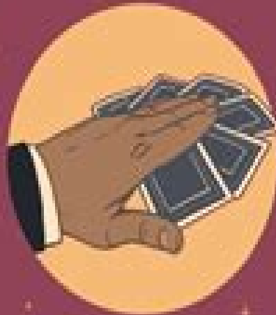
The Magnetic Hand