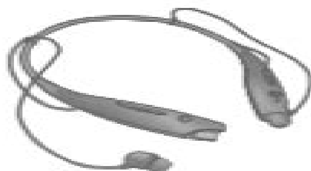
LG | TONE™ HBS-700